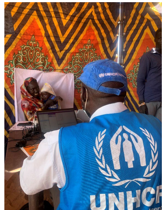
Verification of a South Sudanese refugee woman for refugee registration procedures in Al Lait, North Darfur.

Education Assessment has commenced in refugee-hosting states in Darfur to gather accurate data on refugee education. The education sector is significantly underfunded. The exercise will help better understand existing gaps and challenges facing refugee children to access quality education. UNHCR and partners completed the exercise in Al Lait Locality, North Darfur, where 150 respondents were interviewed, including refugee students, headteachers, teachers and members of the Parents Teachers Association (PTA). Findings of the assessment will be shared upon completion of the exercise in all States.