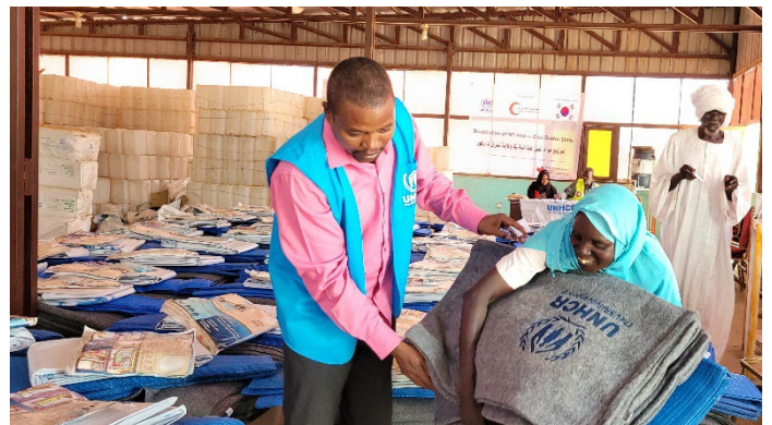
Distribution of NFIs in East Darfur for flood affected IDPs.

UNHCR, as Shelter NFI Cluster lead, continued its flood response in Darfur , where over 46,000 households (HH) were affected by heavy rains and floods. South Darfur was the worst hit by the recent floods, with over 25,000 families affected. The response is ongoing, but UNHCR and partners must prioritize vulnerable groups and women due to inadequate NFI kits to cover all affected families. 1260 HH in Kalma IDP camp received NFIs in October, where 10,000 HH are in urgent need of items. In East Darfur, 1,862 HH, including 762 SSR (641) and host community (121) HH and 1,100 IDP HH through contributions from the Korean Embassy in Sudan, received NFIs distributed through partner Sudanese Red Crescent Society (SRCS). In Central Darfur, 1,154 HHs most affected by floods and heavy rains in five IDP camps in Zalingei and Azum Locality also received NFIs distributed jointly by UNHCR and partner Norwegian Church Aid (NCA). In addition, 829 HH, including newly arrived South Sudanese refugees in Al Lait (450), host community affected by floods (50) and IDPs affected by heavy rains (424), received NFIs during the month. UNHCR Field Office El Geneina, West Darfur, received 1,500 NFI kits.