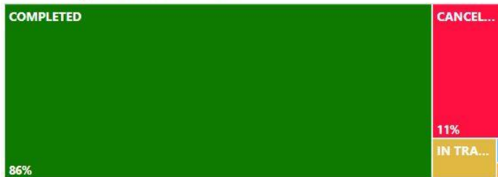
Patient % by Status of evacuation

*In transit: From acceptance of medevac offer to the arrival of the patient in the hosting hospital.