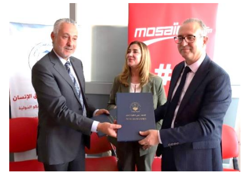
UNHCR, AIHR, and Mosaique FM representatives signed a partnership agreement in Mosaique's office.

To mark the academic school year beginning in September, UNHCR and partners Tunisian Council for refugees (CTR) and Tunisian Scouts launched a back-to-school campaign to support