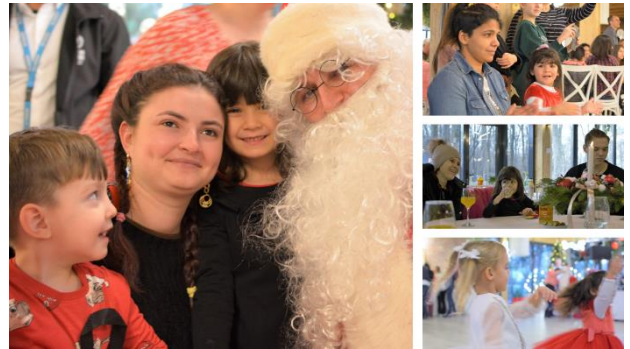
Refugees and host community families at the social event organized by AFF on 19 December 2022.

UNHCR is grateful to the donors of unearmarked and softly earmarked contributions to the Ukraine situation. UNHCR in Romania is also grateful to donors contributing to its 2022 programmes. For more details: https://reporting.unhcr.org/romania-funding-2022