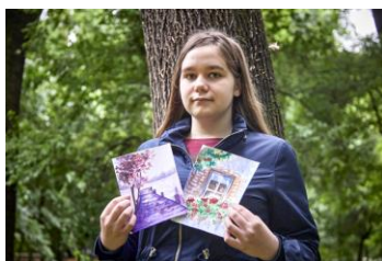
Budding Ukrainian Game Designer Draws Inspiration in Romania