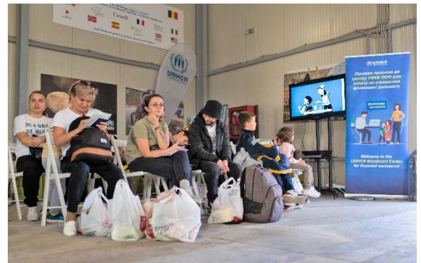
Refugees from Ukraine visiting UNHCR's integrated service hub at RomExpo, Bucharest.