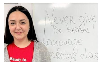
Ukrainian Teacher in Romania is Determined to Remove Barriers.