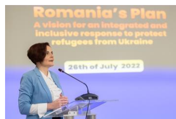
UNHCR Welcomes Romania's National Plan of Measures.