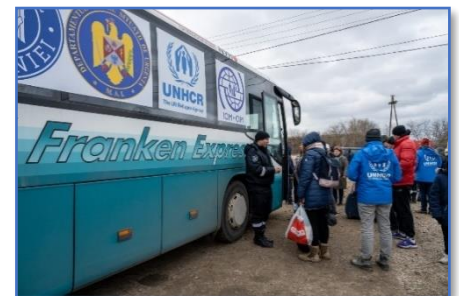
UNHCR supported Fast Track transfers from through the Green Corridor.

Fast-track transfer: A total of 14,636 refugees have been supported to travel to Romania from Ukraine-Moldova border through fast-track transfers in partnership with Department of Emergency Situation and IOM. This project provided refugees from Ukraine with safe and dignified transportation from Palanca border crossing point between Ukraine and Moldova, to Romanian border and further to Bucharest. Palanca has been receiving high numbers of new arrivals, primarily from southern regions of Ukraine, since the onset of the armed conflict.