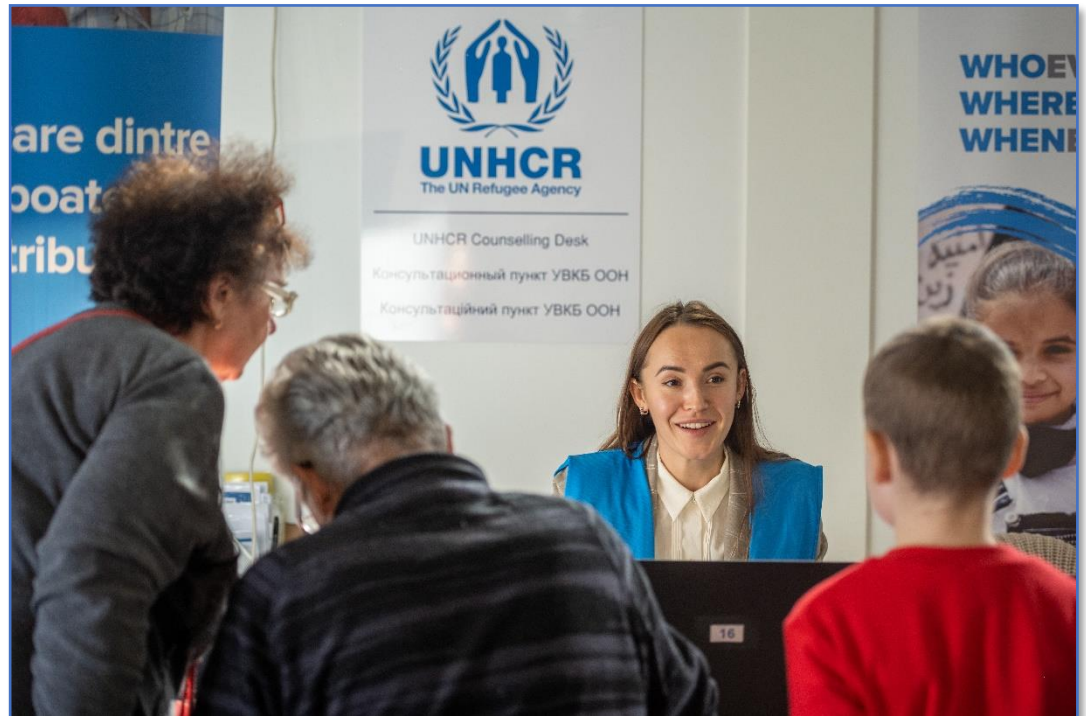
Refugees receiving counselling support at the UNHCR multiservice centre in Bucharest, Romania.

62 temporary reception centres in 10 counties assessed for transitory accommodation.