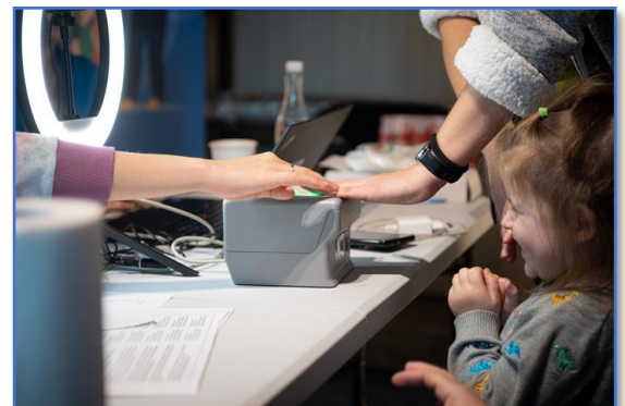
5 enrolment centres in Bucharest, Brasov, Galati, Suceava and Iasi. Mobile enrolment teams across Romania.