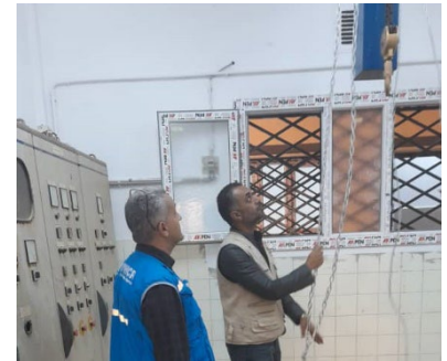
Work at the Sidi Hussein sewage lifting station.

On 29 December, a ceremony was held to mark the rehabilitation work of Sidi Hussein sewage lifting station in north Benghazi, which was overseen by partner Norwegian Refugee Council (NRC). The event was attended by the Water and Sewage Company. The lifting station will service the Sidi Hussein neighbourhood, hosting around 14,000 people including refugees and many Libyans who returned after the fighting in Benghazi in 2017. As it was out of service, many roads in the area had to be closed during the rainy season. The work included repairing of the pump, plumbing, tiling, and electrical work, and painting of the building. The project is part of efforts to rehabilitate basic infrastructure in areas previously affected by conflict and in which large displacement occurred.