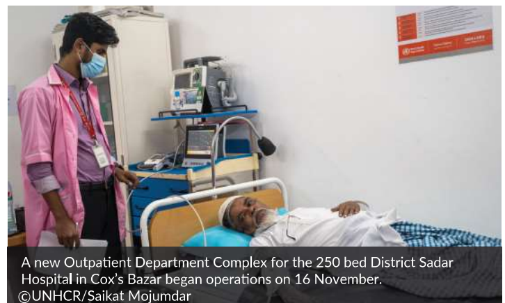
A new Outpatient Department Complex for the 250 bed District Sadar Hospital in Cox's Bazar began operations on 16 November.