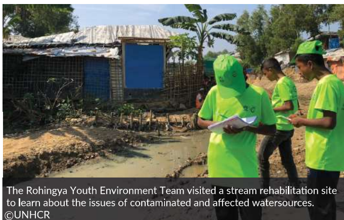
The Rohingya Youth Environment Team visited a stream rehabilitation site to learn about the issues of contaminated and affected watersources.

UNHCR has extended the implementation of SASA! (Start, Awareness, Support, Action) Together to Bhasan Char. This is a community mobilisation programme that supports communities to create positive and sustainable changes around norms that perpetuate violence against women and girls. As part of the programme, UNHCR together with its partner conducted a survey with 320 married refugee women and men to understand the community's perceptions on gender-based violence (GBV), and identified 50 men and women participants for community-led activism for the programme on Bhasan Char.