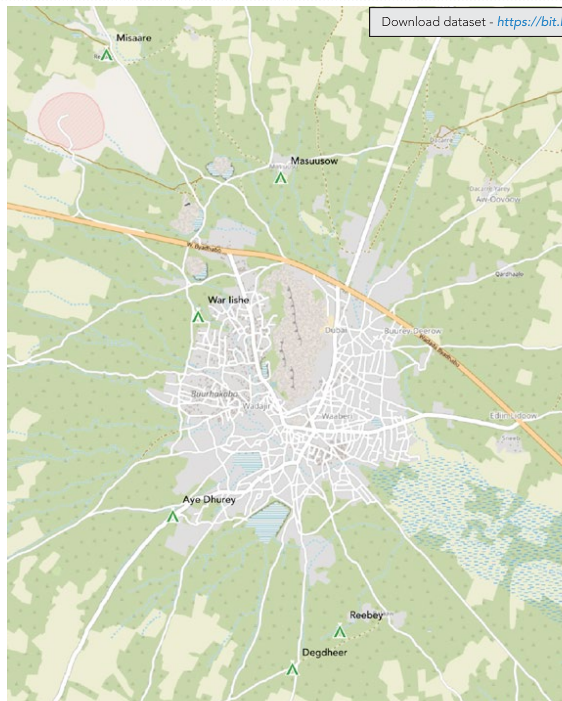
Map of verified IDP sites in Buur Hakaba - November 2022