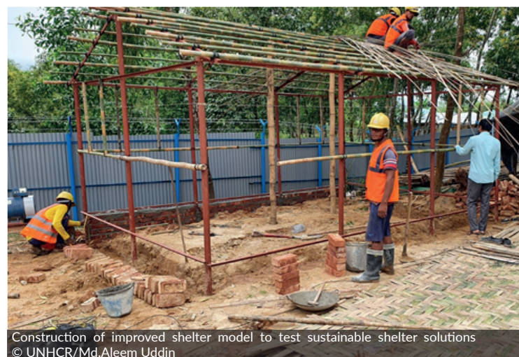
Construction of improved shelter model to test sustainable shelter solutions

UNHCR and partners are working together for adequate and dignified living space for refugees within the approved guidelines. UNHCR promotes effective and sustainable shelter solutions through the efficient use of space and sustainable use of materials. UNHCR continues to reinforce existing temporary shelters with steel footings and treated bamboos. In 2022 new designs continue to be tested and UNHCR continues to advocate for approval of large-scale rollout of these improved designs.