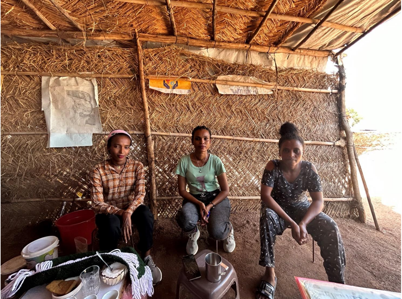
The women's centre in Zone 1 of Um Rakuba camp in Eastern Sudan, is one of several safe spaces available for refugees in the camp. (Other facilities and protection service points in the camp include protection desks, child friendly spaces, psychosocial support centres, and community safe places).