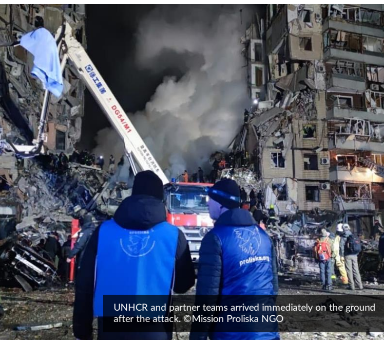
UNHCR and partner teams arrived immediately on the ground after the attack.