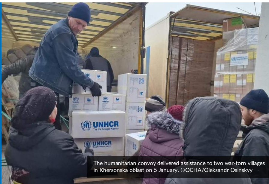
The humanitarian convoy delivered assistance to two war-torn villages in Khersonska oblast on 5 January.

On 7 January, UNHCR joined another UN convoy with life-saving assistance to reach Orikhiv in Zaporizka oblast to support people we have not been able to access due to intense fighting. UNHCR delivered thermal blankets, solar lamps, bedding, and jerry cans to this community who have had very limited access to water, electricity, and gas due to shelling.