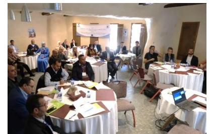
Participants in the Employment and Vocational Training workshops in Zarzis

In December, UNHCR and partner the Arab Institute for Human rights (AIHR) organized a series of workshops with counterparts from Tunisia's Ministry of Employment and Vocational Training. Some 41 participants from the different agencies of the ministry in Tunis and Zarzis took part, with the aim of increasing outreach and inclusion of refugees in livelihood opportunities, and access to work and support advocacy efforts in line with the Global Compact on Refugees.