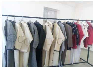
Refugee setting up his traditional clothes shop in Medenine

Thanks to cooperation between UNHCR, partners The Tunisian Association for Management and Social Stability, AIHR, and the Ministry of Employment and Vocational Training, seven refugees were offered job opportunities in Tunisia, while eleven existing refugee livelihood projects were reinforced by new equipment during the month of December. Economic inclusion and expanding employment and livelihood opportunities remain among the most effective protection tools for displaced persons. During 2022, 11 refugees were recruited in the Tunisian market with valid work contracts, while 10 livelihood projects were provided equipment to guarantee their success.