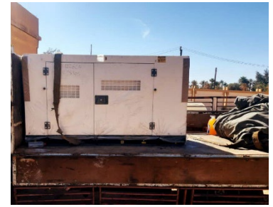
The generator donated to Al Owainat Health Centre.

On 18 and 19 January, UNHCR provided two 30 KVA generators to Al-Qulla Health Centre in Bergen (780 km south of Tripoli) and Al-Owainat Health Centre in Ghat (1,220 km south of Tripoli), in south of Libya. Both centres, which were chosen based on consultations with the local authorities, provide primary healthcare services to displaced people and host community, and the generators will ensure continuity of services during power outages. The donations were part of UNHCR's Quick Impact Projects, aiming to improve community resilience and peaceful coexistence among displaced people, returnees, and the host community.