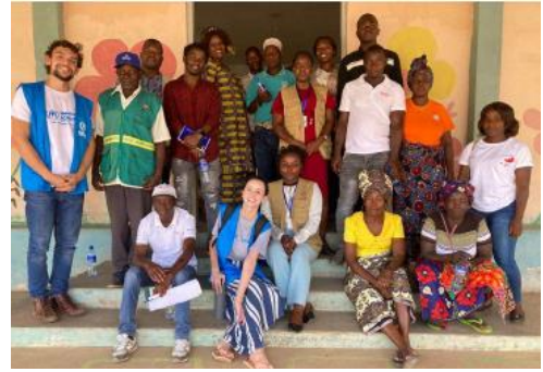
Meeting with legal actors and community members to discuss access to legal services. Montepuez district, Cabo Delgado.