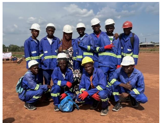
IFPELAC graduates for masonry, Corrane IDP site, Nampula.