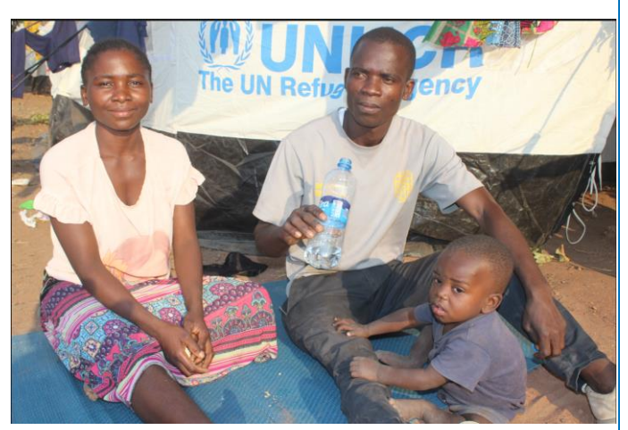
A Congolese refugee family at their homestead in Mantapala settlement©UNHCR/Bruce Mulenga.