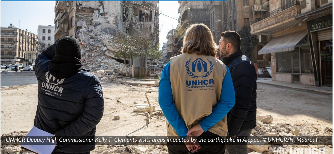
UNHCR Deputy High Commissioner Kelly T. Clements visits areas impacted by the earthquake in Aleppo.

14 February 2023 / Updated as of 16:00 hrs