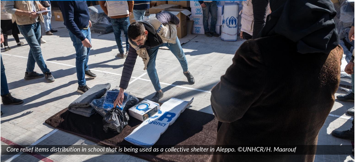
Core relief items distribution in school that is being used as a collective shelter in Aleppo.

16 February 2023 / Updated as of 16:00 hrs