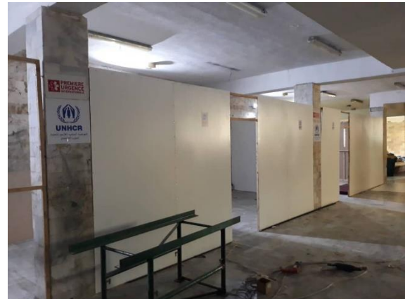
Ongoing works in a collective shelter in Latakia