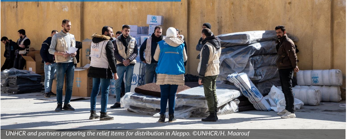
UNHCR and partners preparing the relief items for distribution in Aleppo.

8.8 million people are affected by the earthquake in Syrian Arab Republic