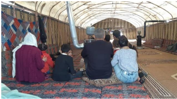
Large-sized tents accommodating affected families in Kobane.