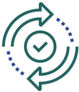
Updates & Achievements