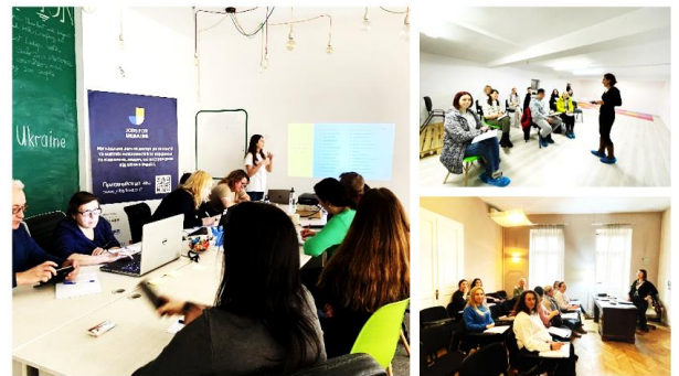
UNHCR and partners supporting women refugees from Ukraine in their endeavours to enhance self-reliance.

UNHCR is grateful to the donors of unearmarked and softly earmarked contributions to the Ukraine situation. UNHCR in Romania is also grateful to donors contributing to its 2023 programmes. For more details: Romania Funding Update - 2023 | Global Focus (unhcr.org)