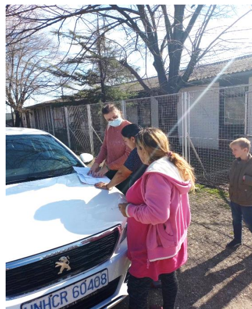
UNHCR partner Praxis visiting the Roma (IDP) settlement Veliki rit in Novi Sad, ©Praxis, 21 February 2023

Over the past decade, Serbia has progressed significantly in statelessness reduction and prevention. Having changed the legislation, the authorities next focused on the harmonization of practice of relevant actors at the local level, resulting in reduction of the number of persons at risk of statelessness from tens of thousands in 2010 to approximately 2,000 today.