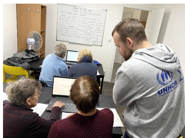
Serbian language lessons in Vranje AC, @Sigma plus, Feb 2023

The UNHCR and the BCHR integration team made a home visit to a refugee from Iraq, single mother of one, and jointly created her personal integration plan. Three other refugees were provided with health insurance cards in February.