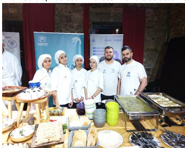
The traditional Deli Monday festival brought together refugees from Iran and Serbian youngsters in preparing and presenting their national dishes

The initial phase of the Project In their Sneakers , implemented by the Ministry of Education and the UNHCR Serbia, has been finalised with the selection of