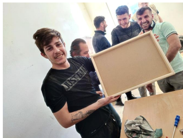
Carpentry workshops implemented by partner Sigma plus are ongoing in Tutin AC, @Sigma plus, Feb 2023

Forty-one children and youths (including 11 from Ukraine) were supported through supplementary lessons in school subjects procured by UNHCR and its partners. Six UASC were in receipt of cash vouchers which serve to buy transport tickets and school supplies.