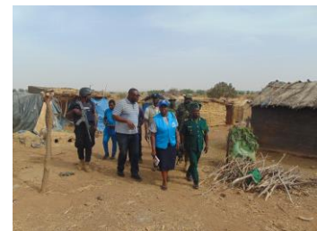
UNHCR Country Rep together with the Executive Secretary of GRB and other officials tour hosting communities in Bawku West District.