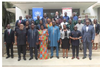
Some participants after the stakeholders meeting on the Burkinabe situation.