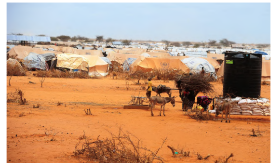
▶ Dadaab Refugee Camp, Kenya.

While the government has maintained an open-door policy regarding the asylum of new arrivals, including from non-neighbouring countries, the encampment policy remains in effect with all asylum seekers and refugees required to live within the designated camps.