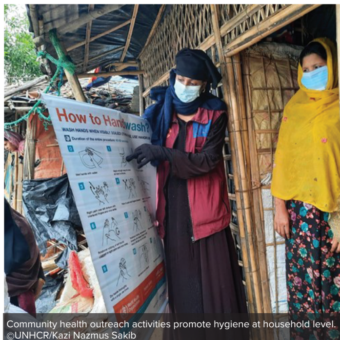
Community health outreach activities promote hygiene at household level.

UNHCR is leading the Health and Nutrition Sector on Bhasan Char in coordination with the health authorities in Noakhali and the Assistant Refugee Relief and Repatriation Commissioner. Since November 2021, UNHCR and partners run two primary healthcare facilities with integrated nutrition and MHPSS services, and support the Ministry of Health hospital with medicines, equipment and human resources. UNHCR and partners have recruited and trained a team of refugee volunteer Community Health and Nutrition Workers, Community Psychosocial Volunteers and Community Refugee Counsellors who support the response through community-based disease surveillance and prevention programmes.