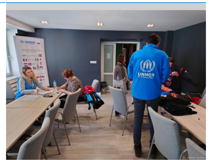
Distribution of winter clothes.

UNHCR has boosted its presence and response to provide targeted protection services, cash assistance and other types of support in line with the Government-led efforts.