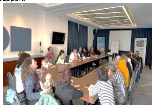
Workshop on starting up business in Romania, facilitated by HEKS/EPER on 19 April.

UNHCR is grateful to the donors of unearmarked and softly earmarked contributions to the Ukraine situation. UNHCR in Romania is also grateful to donors contributing to its 2023 programmes. For more details: Romania Funding Update - 2023 | Global Focus (unhcr.org)