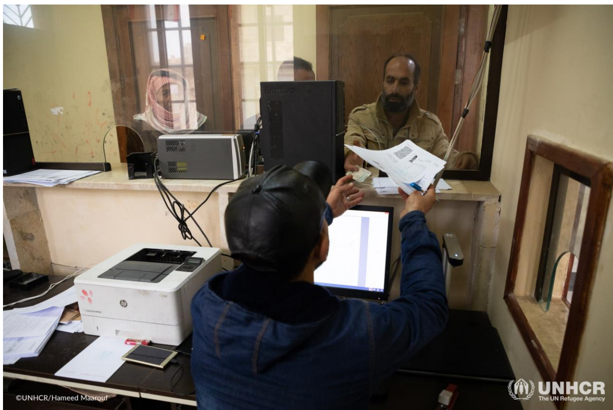
Receiving personal documents at the civil registry centre in Tel Ed Daman, Aleppo Governorate.

Interventions before courts or other governmental bodies support vulnerable individuals who have protection concerns, limited capacity to follow the legal procedures and requirements, difficulties to reach the administrative and legal bodies, or encounter financial constraints.