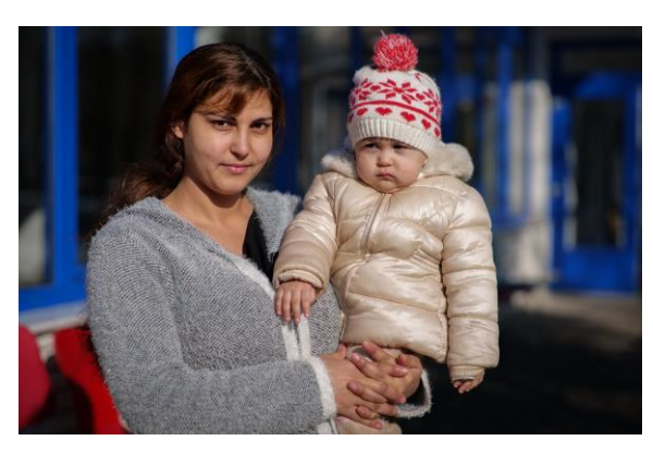
On 9 February 2023 in Debrecen, Hungary a mother holds her child at the Dorcas Ministries Refugee Center ©UNICEF/UN0818922/Ruszthi.

RRP partners supported almost 4,000 refugee children through safe spaces, protection and support hubs across the country and in Blue Dots set up at the border crossing points from Ukraine. Over 1,400 children were targeted with communitybased child protection services and almost 3,000 children were supported through specialized child protection services. RRP partners also trained over 500 humanitarian staff on child protection and children's rights.