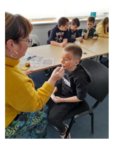
Recreational activities at the center in Budapest.