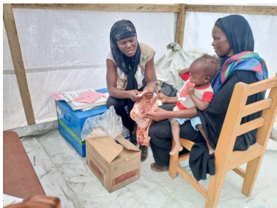
Treatment of severe acute malnutrition with plumpy nut on a child under 5 years old in Koufroun 7 May 2023