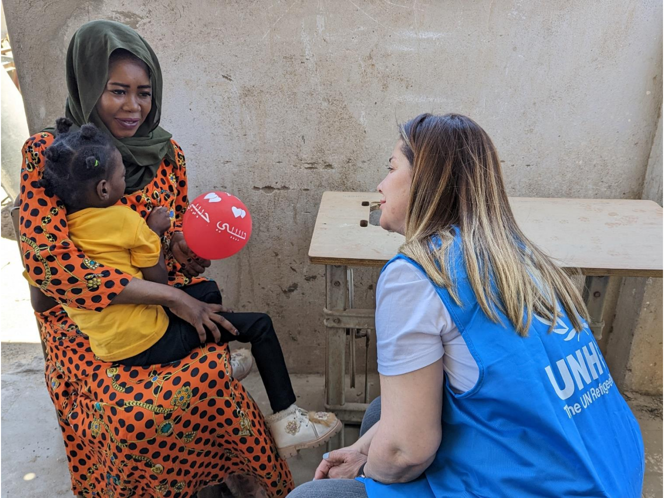
UNHCR's Egypt Representative met with Sudanese new arrivals in Aswan as part an interagency needs assessment exercise to respond to the new influx to Egypt from Sudan.