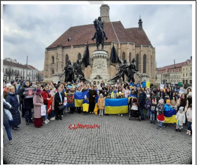
Valentine’s Day Youth Event with Ukrainians, Romanians, and Roma Youth, Ukraine House Sighisoara, 14 February 2023, ©Shnarova Yuliia