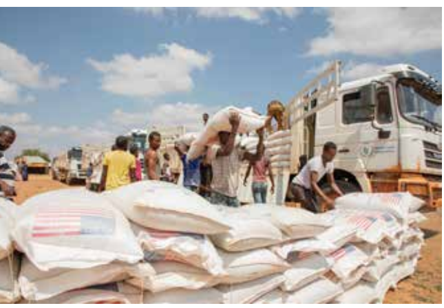
The inter-agency community responded to the high rates of food insecurity by distributing food in three kebeles hosting a large number of refugees.