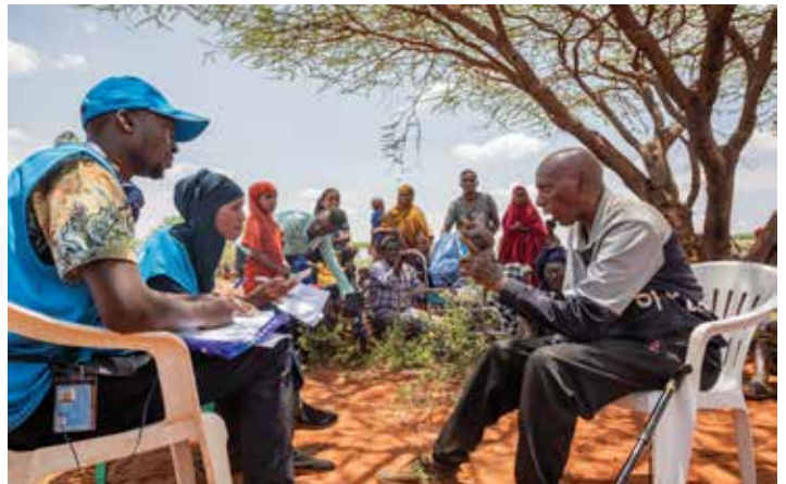
Protection teams continue identification of persons with specific needs in the Mirqaan Settlement.