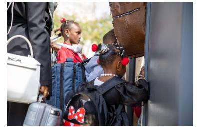
Refugees on their way to Mitiga Airport for their departure to ETC in Romania.

On 31 May, more than 100 refugees left Libya for the Emergency Transit Centre (ETC) in Romania, with the logistical support of International Organization for Migration (IOM). In the ETC, the group, including individuals from Sudan, Eritrea, Syria, South Sudan, Somalia, and Yemen, will be processed for their resettlement to Norway. Since 2017, UNHCR has resettled more than 3,400 refugees to Europe, Canada, and Australia. UNHCR is grateful to the relevant Libyan authorities for their support in facilitating necessary formalities for these departures and continues to urge countries to provide more legal pathways to help asylum-seekers and refugees with heightened protection risks reach safety out of Libya.