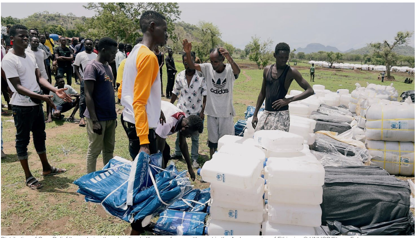
Distribution of Core Relief Items during the relocation to Kumer refugee settlement in the Amhara region of Ethiopia.