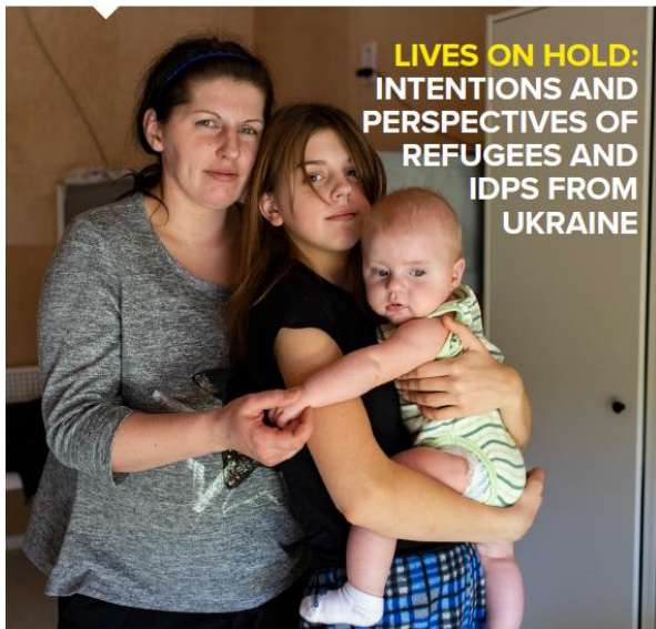
REGIONAL INTENTIONS REPORT #4 JULY 2023

UNHCR continues to consult Ukrainian refugees and internally displaced people on their intentions and concerns and published an updated report presenting findings regarding the intentions of both refugees and IDPs, to provide a comparative view of intentions and the different underlying factors influencing decision-making.