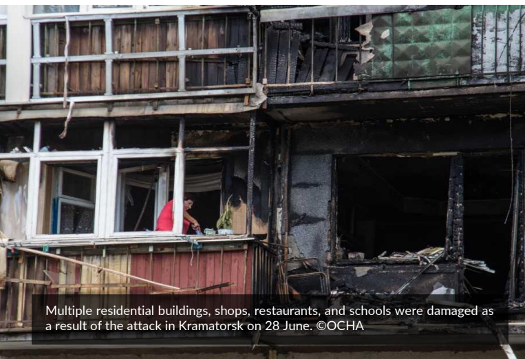
Multiple residential buildings, shops, restaurants, and schools were damaged as a result of the attack in Kramatorsk on 28 June.