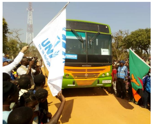
Congolese refugees assisted with voluntary repatriation from Mantapala settlement to the DRC do so in safety and with dignity.