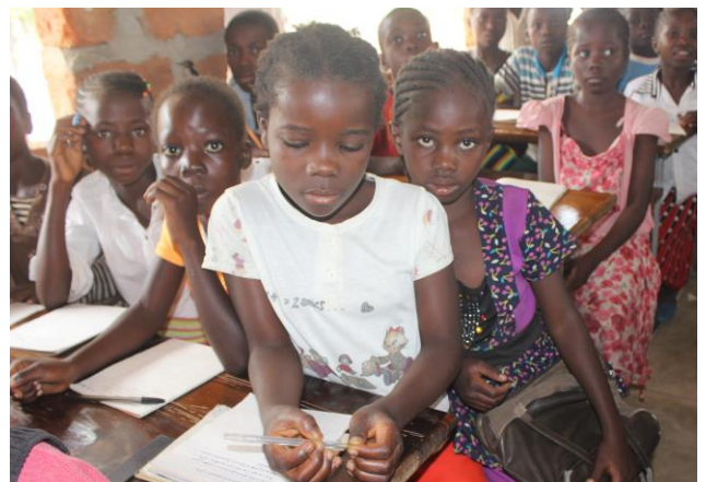
Congolese refugee learners at a school in Mantapala settlement