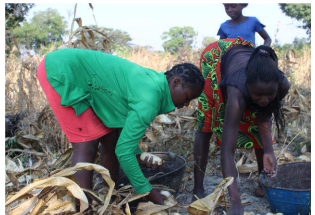
Beneficiaries of the Government's Farmer Input Support Programme (FISP) in Mayukwayukwa refugee settlement harvesting maize at one of their plots.