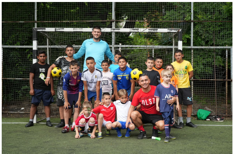
Refugee children from Ukraine played football with locals at the annual Sports Day organized by UNHCR partner Hungarian Red Cross in Dunaujvaros.

1 Multi-country office in Budapest, also supporting national offices in the Czech Republic, Slovakia and Slovenia.