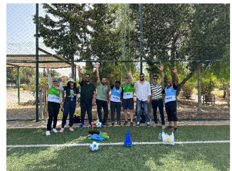
Sport for Peace Workshop.

Between 10 and 13 July, UNHCR, together with partners Fútbol Más and Moomken, organized a workshop in Tunis to discuss the upcoming activities of the Sport for Peace Project, a pilot programme with football at its heart, to contribute to improving psychosocial well-being amongst IDPs, IDP returnees, asylum-seekers, refugees, and host communities in Abusliem municipality in Tripoli. The workshop gathered staff members from Fútbol Más, Moomken, and UNHCR. The three-day workshop aimed to equip Moomken's field coaches with the necessary knowledge to effectively implement Fútbol Más' green card philosophy within the Sport for Peace Project. In addition to the theoretical and practical sessions, the training incorporated brainstorming sessions to identify priority areas of intervention and develop a Theory of Change model.