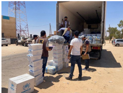
NFI distribution of UNHCR and IRC in Alassa.

On 12 July, UNHCR along partner International Rescue Committee (IRC) carried out a joint visit to Alassa (120 km West of Zawya) to