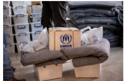
NFI distribution at the JMC to those who were transferred from Ain Zara Detention Centre to the urban setting.

Between 11 and 13 July, UNHCR helped with the transfer of 220 individuals from Ain Zara detention centre to the urban setting. They were brought to the Jugurthine Medical Centre (JMC), where UNHCR and partners provided cash assistance, vouchers, which can be used in pre-defined shops, and non-food items. Asylum-seekers were also counselled on how to contact UNHCR and partners, how to book appointments and available services. UNHCR continues to work closely with the Libyan authorities to secure the orderly transfer of other refugees and asylum-seekers held in detention to the urban setting.