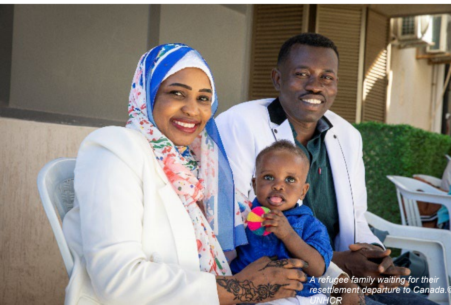
A refugee family waiting for their resettlement departure to Canada.