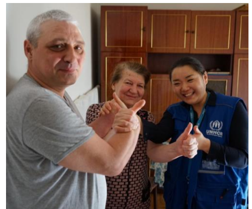
UNHCR Slovakia supports a refugee with disability and his family to resume active lifestyle.