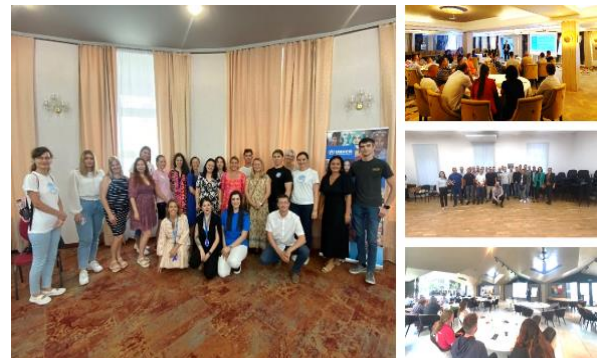
Protection training sessions in Suceava, Baia Mare, Sighetu Marmatiei, and Constanta.

UNHCR continues to support the capacity building of national NGOs and authorities concerning child protection and gender-based violence (GBV). Over the past weeks, UNHCR conducted four trainings for authorities and NGOs working with refugees in different cities in Romania such as Suceava, Sighetu Marmatiei, Baia Mare and Satu Mare. Over 100 officials attended these sessions on child protection and prevention of gender-based violence. In addition, UNHCR carried out training on protection fundamentals for 40 NGO staff in Constanța and Galați. So far in 2023, UNHCR has provided various trainings on refugee protection to more than 600 officials from local authorities and NGOs.