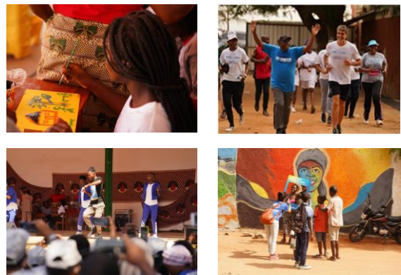
On 20 June 2023, World Refugee Day was celebrated globally around the theme "Hope away from home". Alongside local government partners, UNHCR organized cultural and sports activities with and for refugees, including internally displaced people and members of the host community as well. Above photo, activities in Pemba, Cabo Delgado