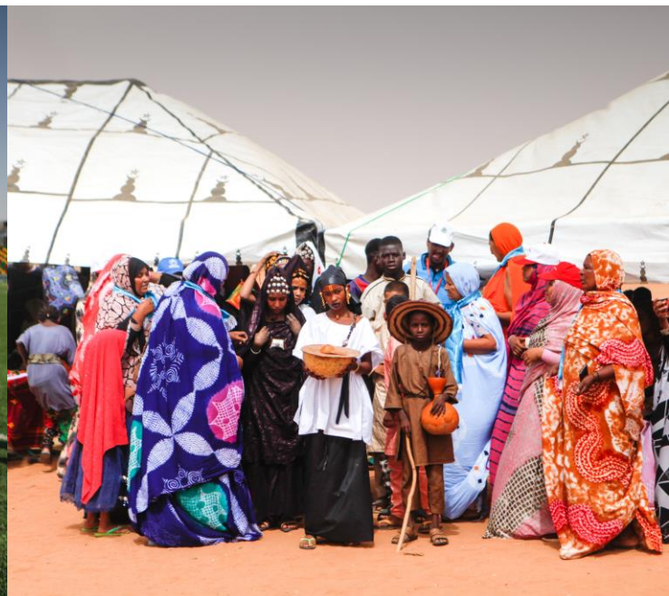
Mauritania. Refugees and host communities celebrating together in Nouakchott and Bassiknou