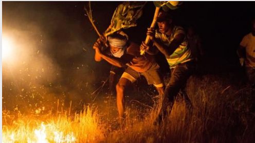
The Fire Brigade: Refugees Fight Against Climate Change