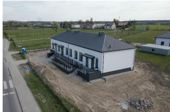
Former school in Wolka Krowicka