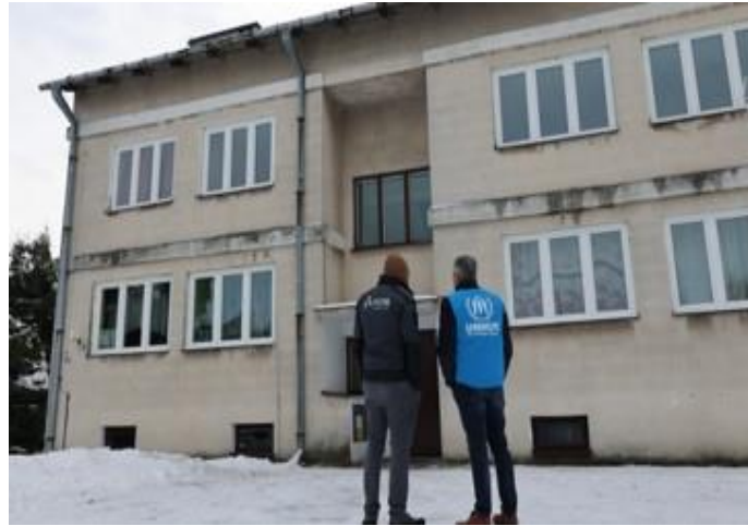
Municipal social flats in Ossowa, Wohyn

600 additional beds only in Podkarpackie region