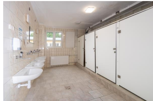
Student dormitory in Kluczkowice