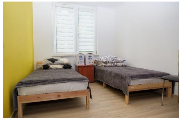
Municipal flats in Chelm

UNHCR is grateful for the support from our top government donors of unearmarked, softly earmarked, and earmarked funding: Belgium | Canada | Denmark | France | Germany | Ireland | Italy | Japan | Netherlands | Norway | Sweden | Switzerland | United Kingdom | United States of America UNHCR is also grateful for the generous contributions from the private sector and individuals.