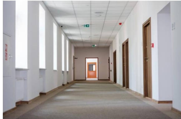
Przemysl Sports Complex (POSiR)