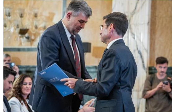
On 1 November, Prime Minister Marcel Ciolacu hosted UN Agencies and guests for the marking of UN Day at Victoria Palace.

On 1 November, the United Nations (UN) agencies in Romania marked UN Day with an event hosted by the Government of Romania at Victoria Palace in Bucharest. The Prime Minister, Mr. Marcel Ciolacu, and some 250 representatives of national and local authorities, the diplomatic community, NGOs, and partners were present. In his opening address, Prime Minister Ciolacu said “ The UN Refugee Agency has played a vital role in supporting refugees and asylum seekers in Romania. Their tireless commitment to protect, assist those forced to leave their homes is a clear testament to the principles of humanity and compassion promoted by the UN. ” During the evening a joint press release was issued and the event was streamed on-line.