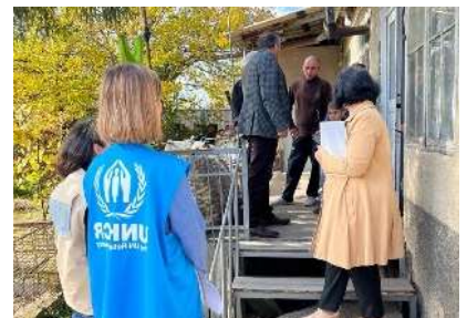
Lori province - UNHCR and authorities jointly carry out house visits to learn about refugees' needs.