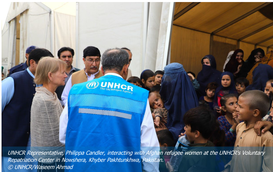
UNHCR Representative, Philippa Candler, interacting with Afghan refugee women at the UNHCR's Voluntary Repatriation Center in Nowshera, Khyber Pakhtunkhwa, Pakistan.