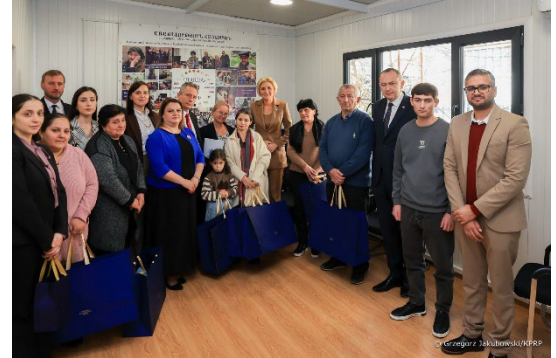
UNHCR facilitated a meeting between the First Lady of the Republic of Poland, Ms. Agata Kornhauser-Duda, and refugees about their situation and urgent needs.

UNHCR is grateful for the support of donors: Australia | Belgium | Canada | CERF | Czech Republic | Denmark | France | Germany | Ireland | Japan | Netherlands | Norway | Poland | Sweden | Switzerland | United Kingdom | United States of America